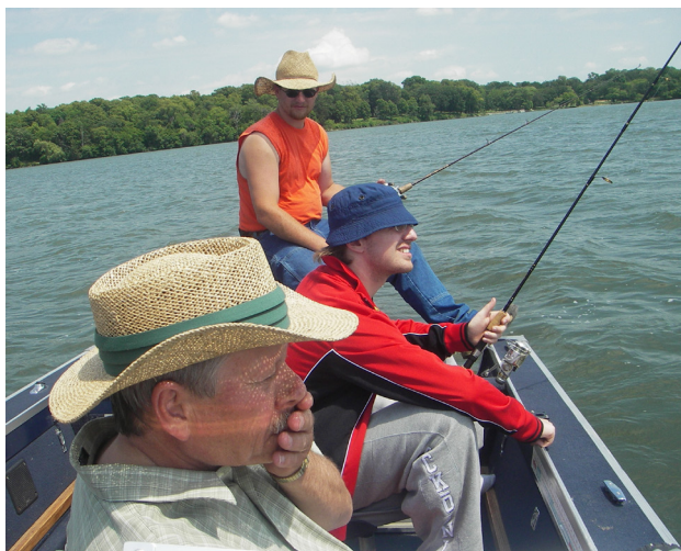
Drift fishing vertically for catfish in Minnesota, USA.

1 Describe how Jörgen Larsson fished during "traditional" vertical fishing? _____