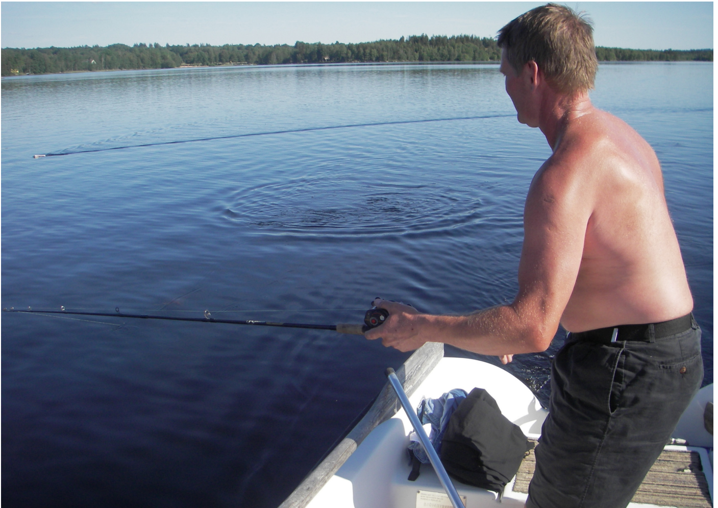
Bite on a free rod. The side planer attached to another rod is seen to the left.